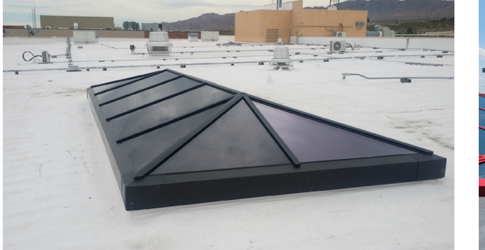
*Additional configurations, including segmented barrel vaults, are available. Custom designs are also available. Contact us for details.