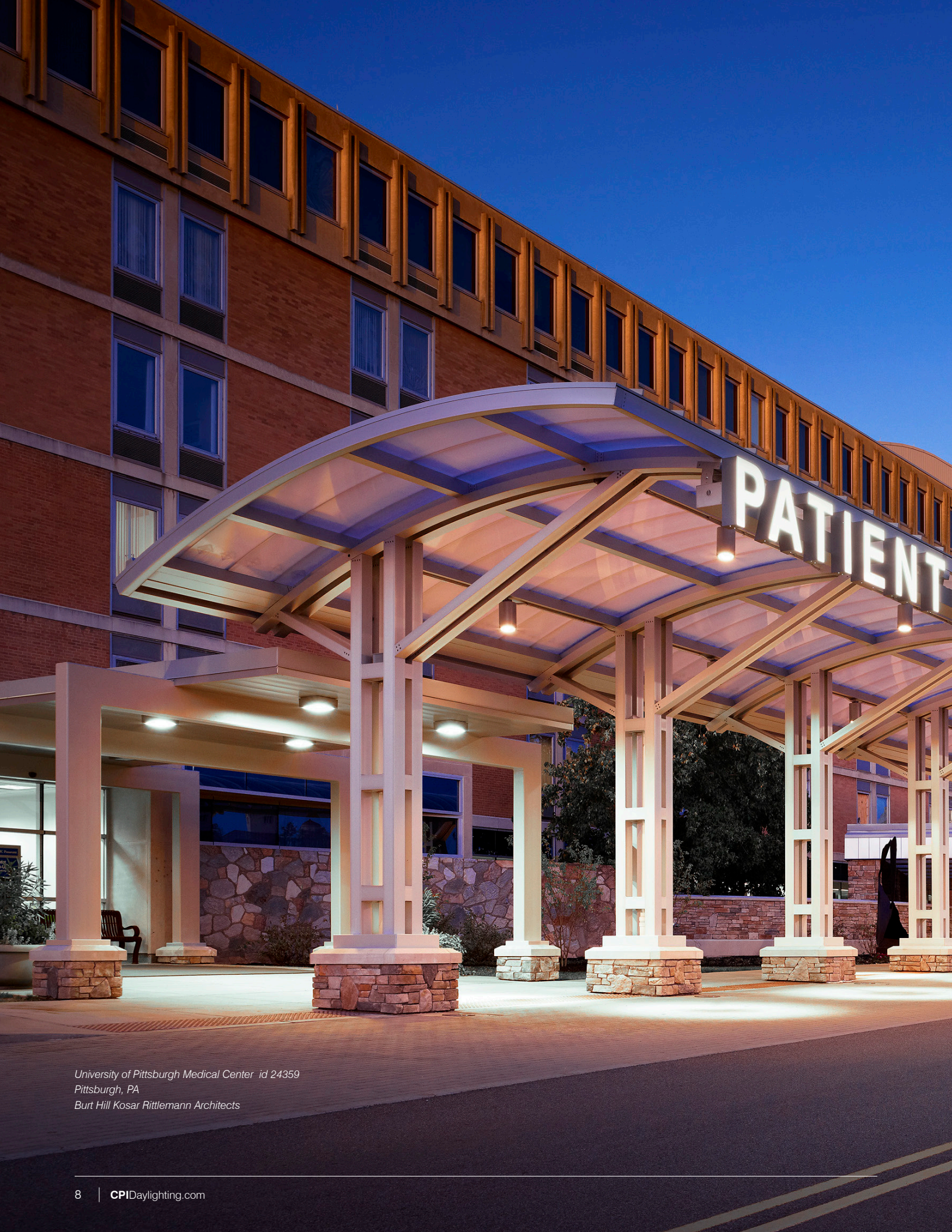
University of Pittsburgh Medical Center id 24359 Pittsburgh, PA Burt Hill Kosar Rittlemann Architects