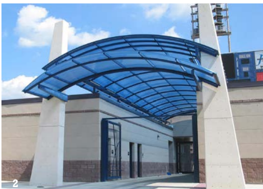
1 BWI Airport / Baltimore, MD / URS Corporation / id 9682 2 Mississippi Memorial Stadium / Jackson, MS / CDFL Architects / id 15251