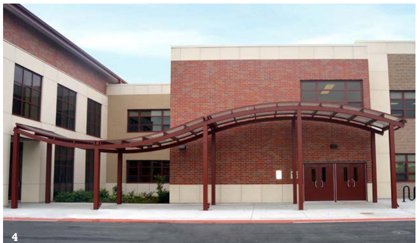
3 Osborne Rapid Transit Station / Winnipeg, MB / ft3 / id 30661 4 Barack Obama Learning Academy / Hazel Crest, IL / JMA Architects / id 37229