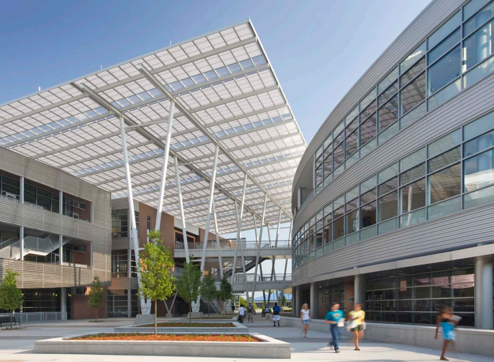
▲ University of N. Florida Student Center id 24863 Jacksonville, FL Rink Design