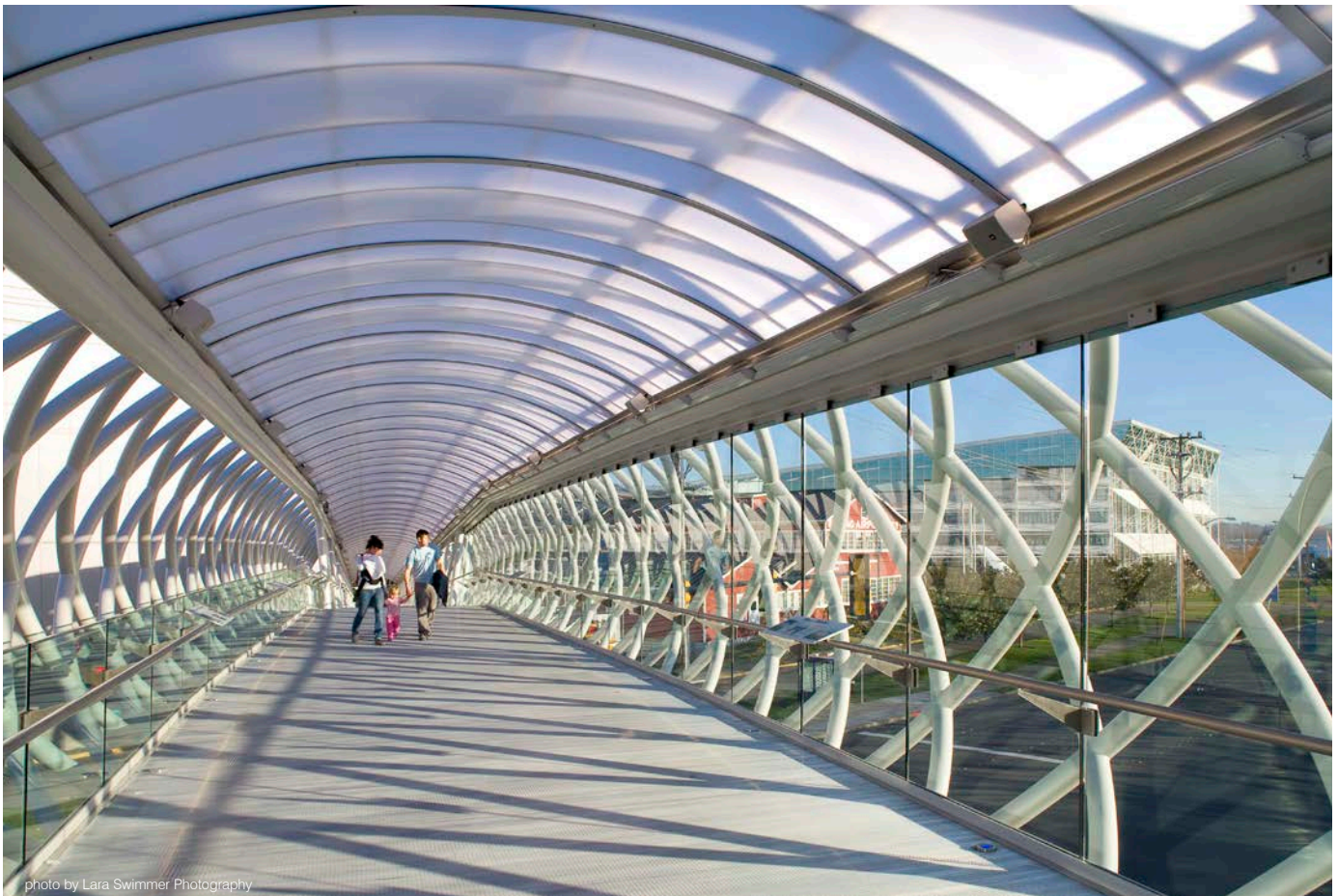
▼ Museum of Flight Bridge id 25284 Seattle, WA SRG Partnership